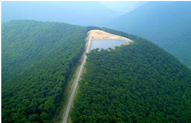
Well pad

What can I do to help? 1. Contact the governor, DCNR, and your state representative and state senator. 2. Sign up for email updates: saveloyalsock@gmail.com . 3. Take the Loyalsock Forest driving tour of the places at risk at www.saveloyalsock.org .