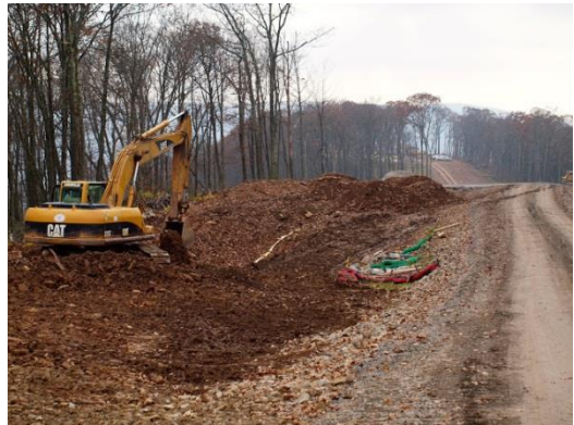
Clearing a forest road: credit: FracTracker